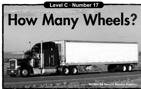
Mini Pocket Books