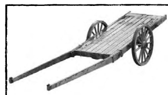
Mini Pocket Books